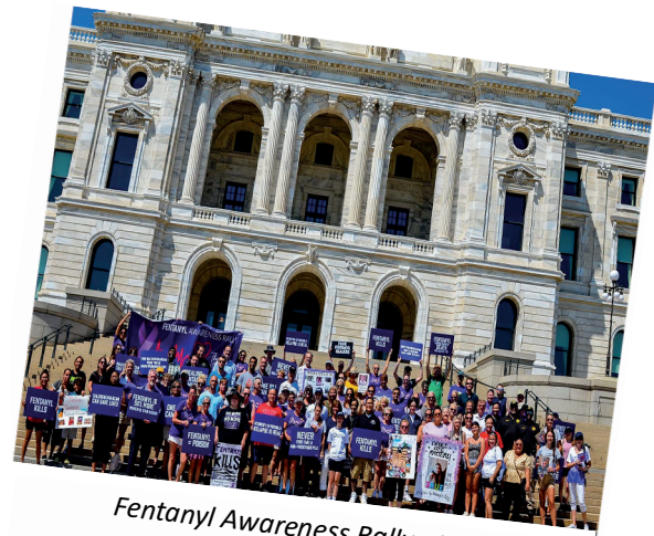
Fentanyl Awareness Rally at the Minnesota State Capitol